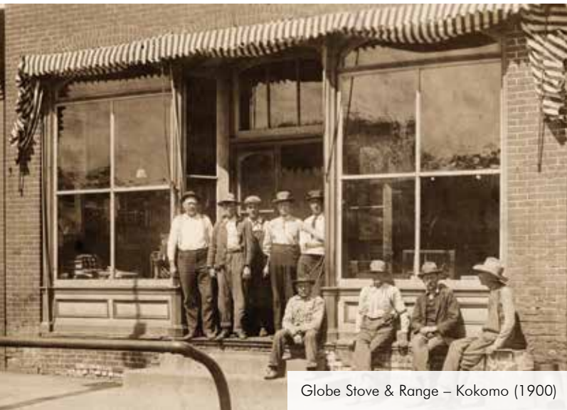
Globe Stove & Range – Kokomo (1900)