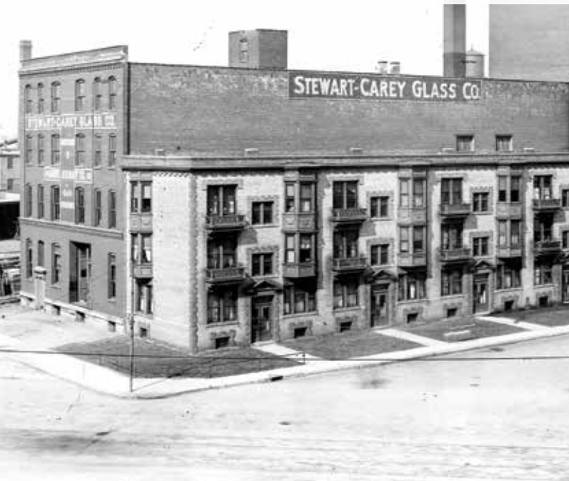
Stewart-Carey Glass Co. – Indianapolis (1912) Bass Photo Co. Collection