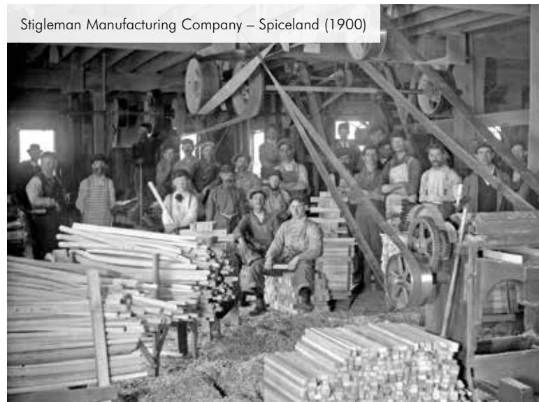
Stigleman Manufacturing Company – Spiceland (1900)