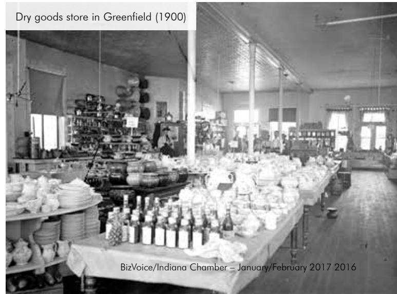
BizVoice/Indiana Chamber – January/February 2017 2016