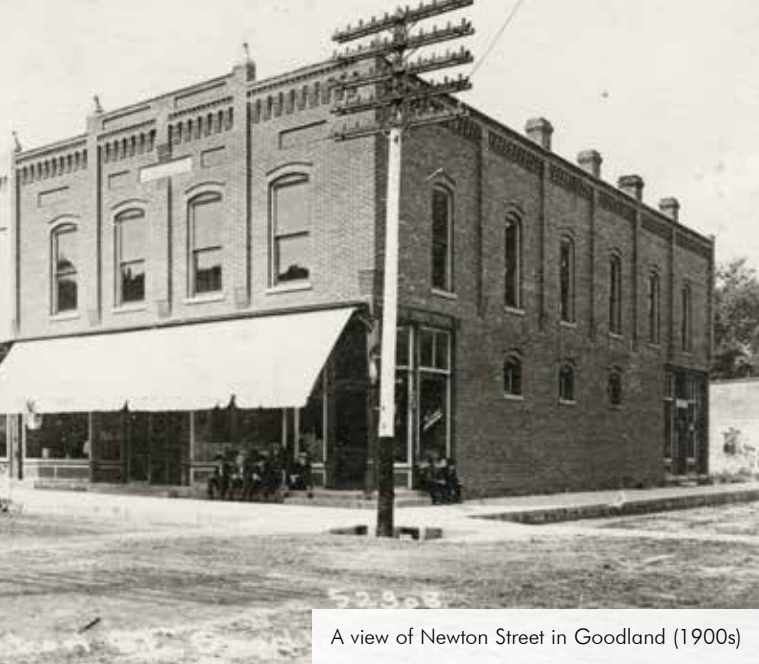
A view of Newton Street in Goodland (1900s)