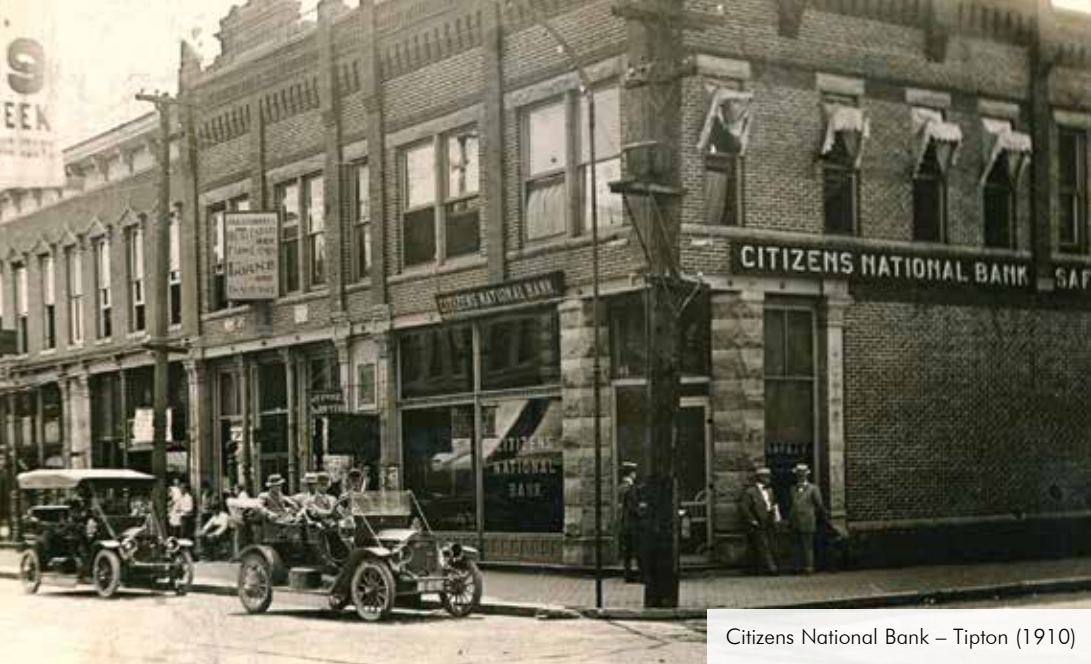
Citizens National Bank – Tipton (1910)