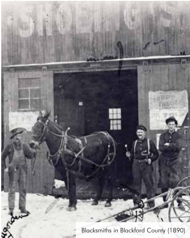
Blacksmiths in Blackford County (1890)