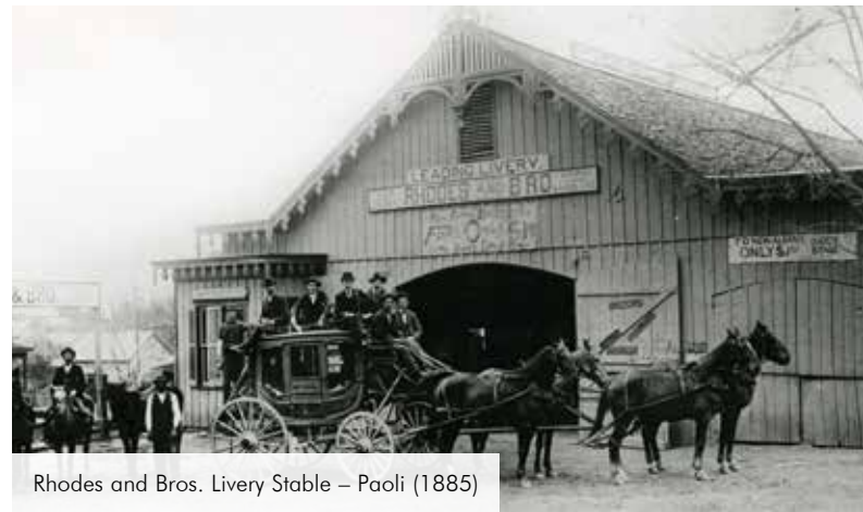
Rhodes and Bros. Livery Stable – Paoli (1885)

Photos and assistance provided by the Indiana Historical Society.