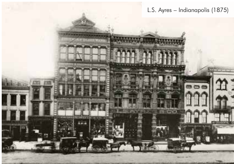
L.S. Ayres – Indianapolis (1875)