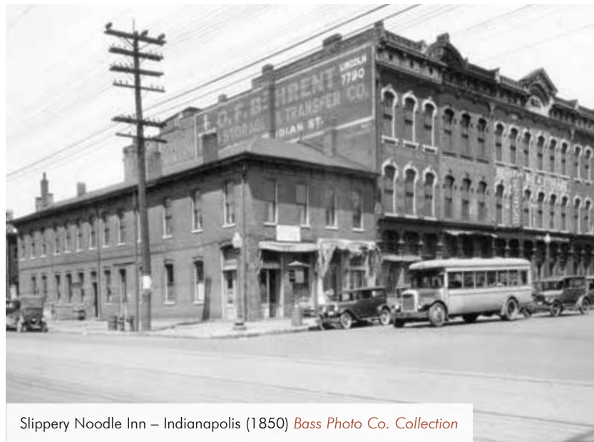
Slippery Noodle Inn – Indianapolis (1850)