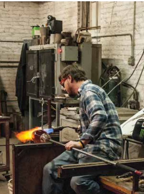
Howard County has a rich glass heritage, with Kokomo Opalescent Glass in operation since 1888.