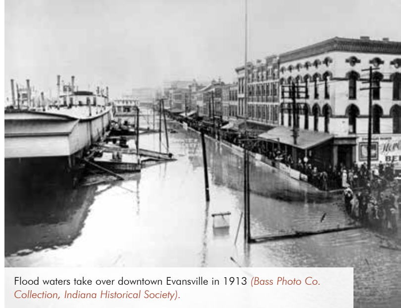
Flood waters take over downtown Evansville in 1913.