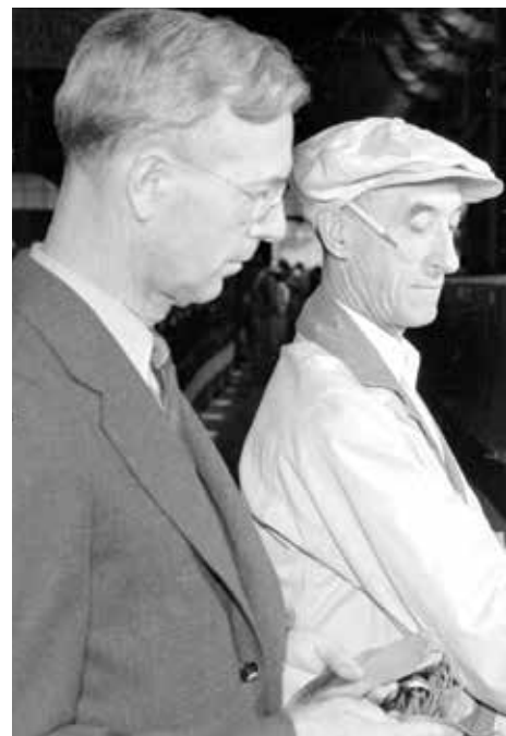
The LaPorte County Fair is Indiana's oldest, dating back to 1845.