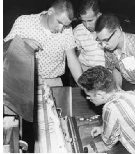
Workers in Jasper gain insights on piano construction.