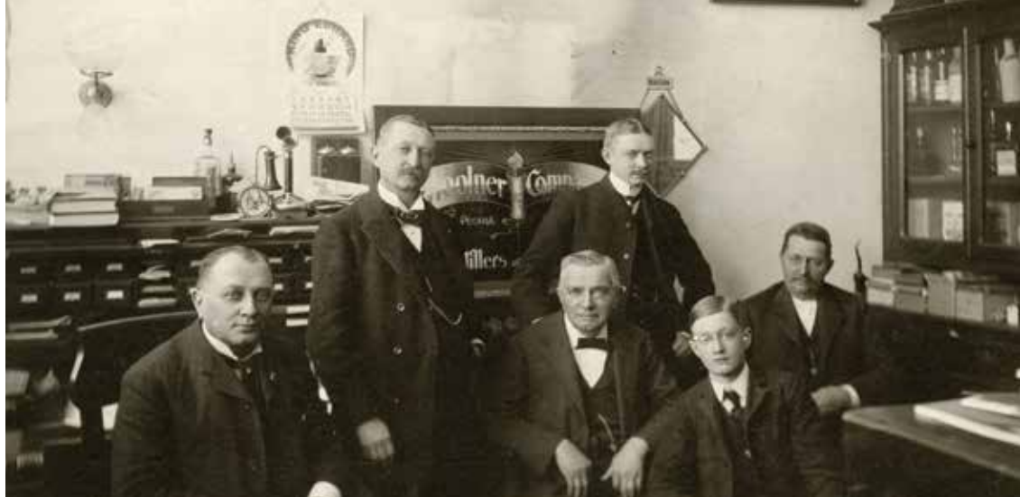
Office workers at the Kamm and Schellinger Brewery, which began operations in Mishawaka in 1853.