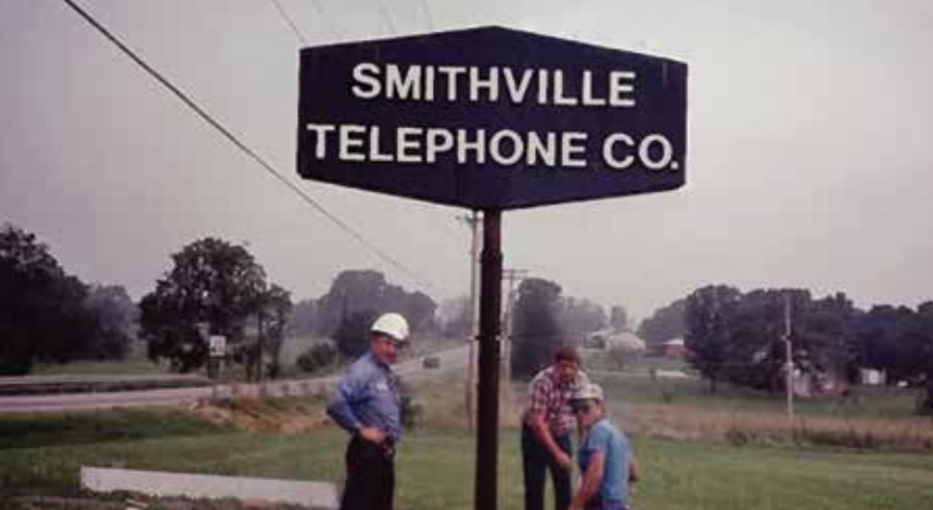
Now known as Smithville Fiber, the former telephone company has served Hoosiers for nearly a century.