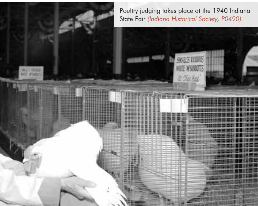
Poultry judging takes place at the 1940 Indiana State Fair.