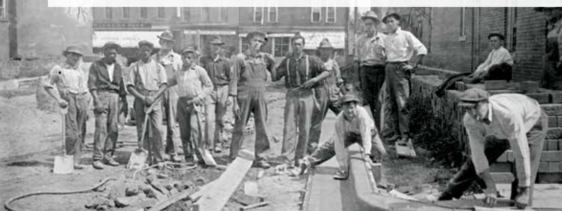
The "curbing gang" paves the way for vehicle traffic in South Whitley.