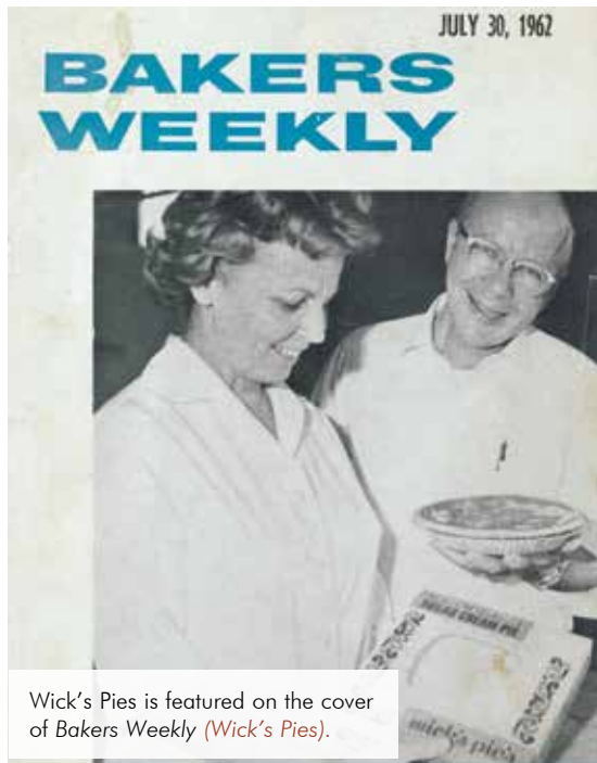
Wick's Pies is featured on the cover of Bakers Weekly ( Wick's Pies ).