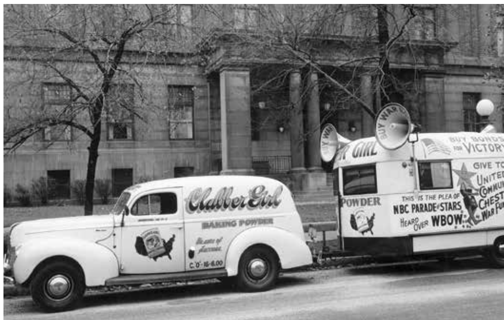
A Clabber Girl Baking Powder truck supports the war effort in 1943.