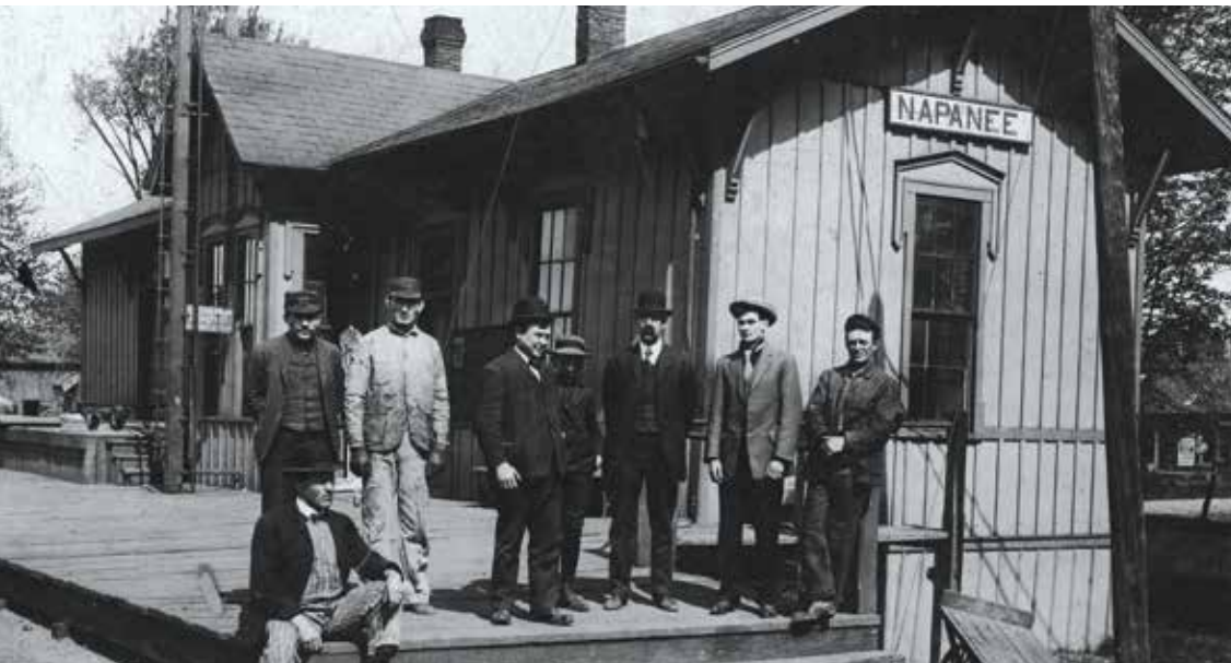
This Nappanee train depot (note misspelling on sign) was built in 1874 when the Baltimore & Ohio Railroad started service in the area.