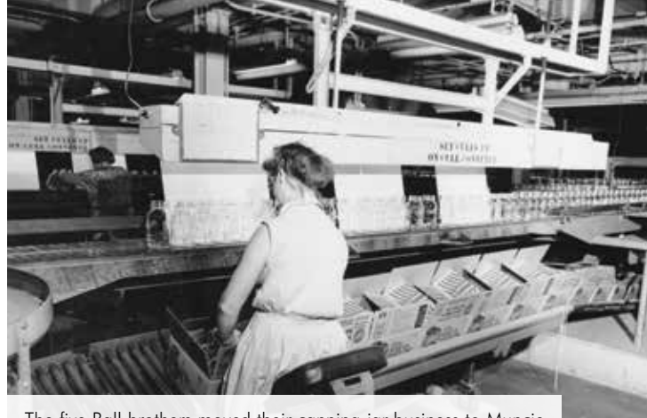
The five Ball brothers moved their canning-jar business to Muncie in 1887 due to the area's abundant natural gas preserves.