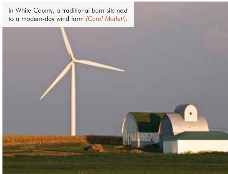
In White County, a traditional barn sits next to a modern-day wind farm ( Carol Moffett ).