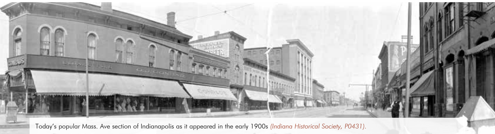
Today's popular Mass. Ave section of Indianapolis as it appeared in the early 1900s.